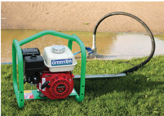
No priming needed