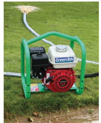
Includes 10m hose