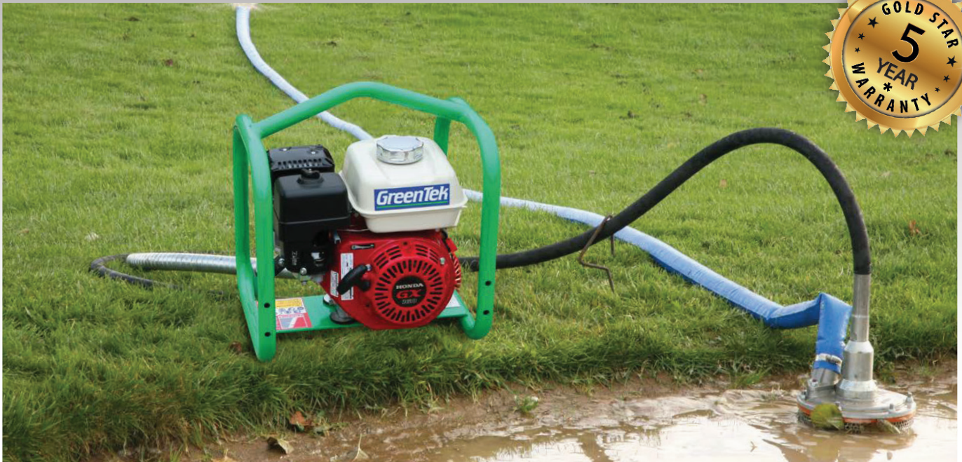
Pump handles muddy water